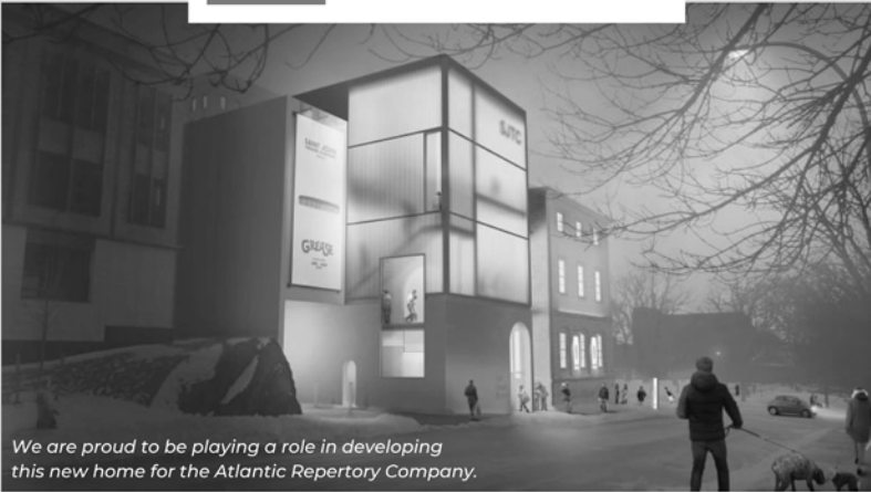
We are proud to be playing a role in developing this new home for the Atlantic Repertory Company.