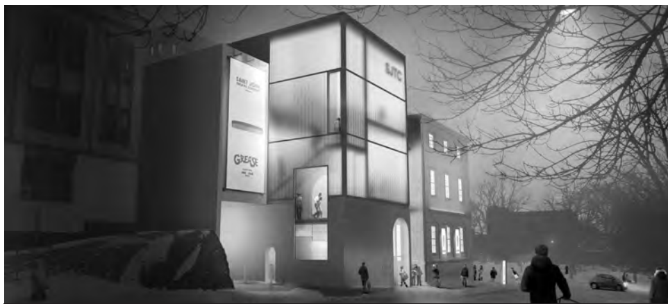
THE COURTHOUSE STAGE THEATRE FACADE.

The Courthouse Stage is being built as a true production house, a place to create, develop, and present the work of the Atlantic Repertory Company (ARC). It will be a hub for Made-in-Saint John culture: Theatre created by Saint John artists, for Saint John audiences.