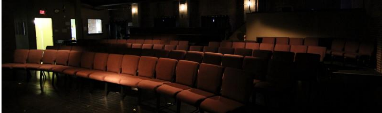
The BMO Studio Theatre