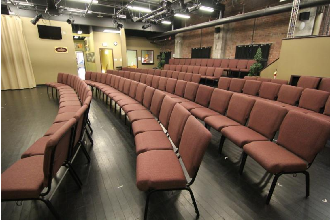
Theatre (seating for 100)