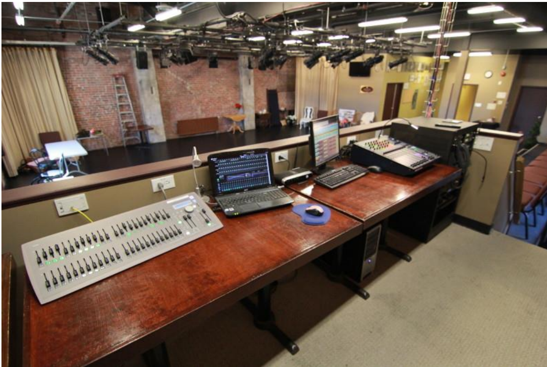
Sound and Lighting Booth