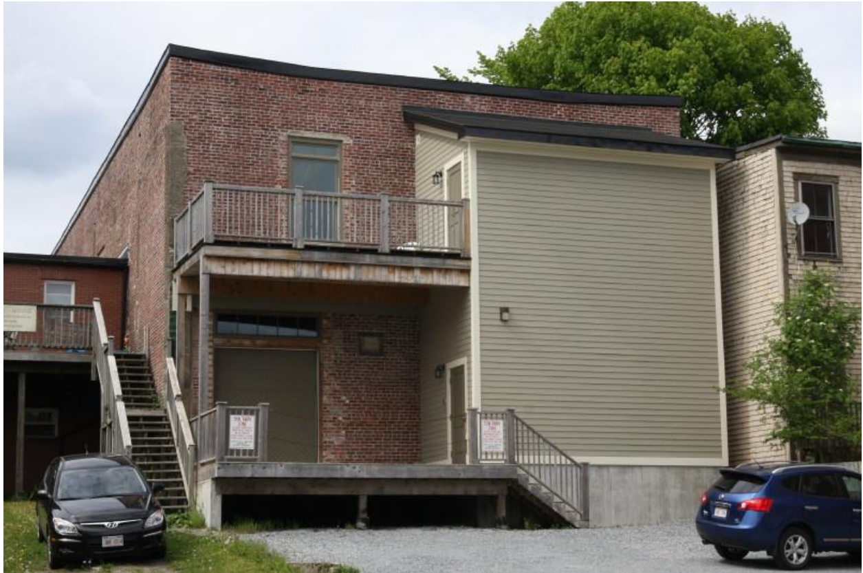
Loading Dock at Back of Building

Loading Dock: Rear of building off Horsfield St. (Dock height is 4'). Loading door; 8' (W) x 9' (H)